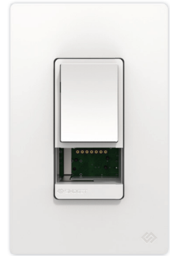
Auxiliary Control Switch S16009WA