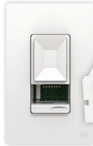
Dimmer Switch + HD Camera