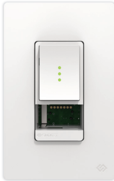
20/40/60 Timer Control Switch S16008WA