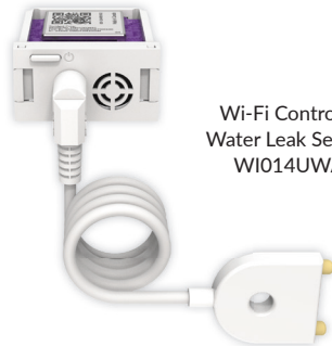
Wi-Fi Control + Water Leak Sensor WI014UWA