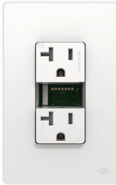
20A Outlet R1020SWA