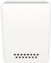
Wi-Fi Control + Particulate Matter Sensor WI013UWA