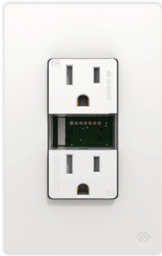
15A Outlet R1015SWA